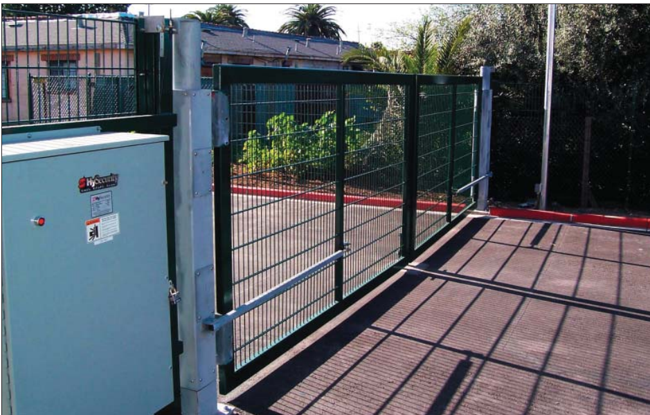
Separate electrical enclosure (left) operates both gate panels in unison in this SwingRiser Twin configuration.

The HySecurity SwingRiser gate operator is supported by a 5 year warranty when it is installed by a licensed contractor. A nationwide network of distributors and installers is available to service the warranty. Labor and other costs to replace defective components are excluded from this factory warranty; however, these costs may be covered through the local installing company. Complete warranty terms and conditions are available from the manufacturer. For details, consult HySecurity.