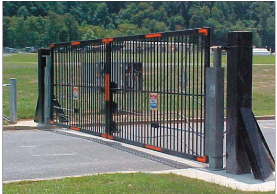
SwingRiser 30 Twin operating heavy crash gates installed at Camp Dawson training facility in West Virginia

perature extremes from -40 - 167 degrees F (-40 - 75 degrees C)