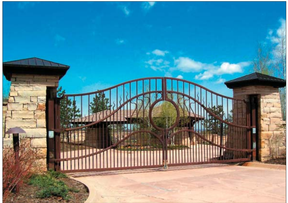
SwingRiser 19 Twin UPS with ornamental iron bi-parting gate installed at Colorado private golf course entrance